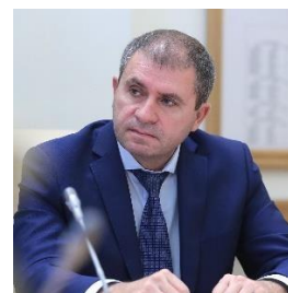
K.N. Rachalovsky , Minister of Agriculture and Food of the Rostov region